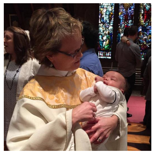
"Why do you look for the living among the dead? He is not here, but has risen."

Easter is a powerful statement – that no darkness or death is more powerful than the light of God. But it is also a call to action for all of us. It is a call to model Christ in the world in the way he showed us before his death – to love and to serve as he did for us.